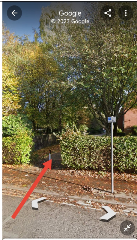
Lower Byrom St

Should patrons continue along Lower Byrom St, to Quay St, they then must pass the large apartment building, Rossetti Place, before the opportunity to disperse into the main, busier NTE areas of Quay St, Peter St, etc.